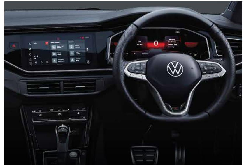
DUAL TONE DASHBOARD